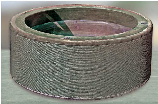
Regenerated grinding roller of rectangular cross section with KALMETALL-W 100 hard overlay welding, diameter 1,500 mm