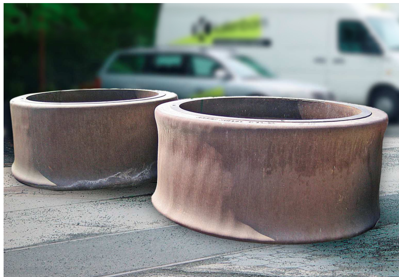
Grinding rolls of vertical roller mills are subject to considerable wear; these are worn down raw meal grinding rollers prior to regeneration