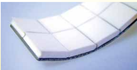
Optional book-end joints