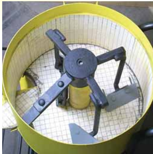
Forced circulation mixer for building compounds, protected against wear - the KALOCER high alumina ceramic mosaics adapt well to the existing geometry