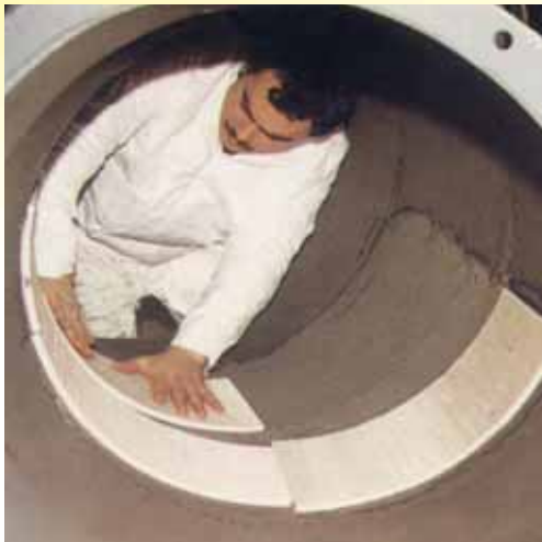
Lining a dust collecting pipe for clinker with 6 mm thick KALOCER mosaics placed in KALFIX epoxy setting compound