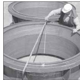
Separating cones of cement classifiers made of KALMETALL-W 100 6+4, 3,000 mm diameter