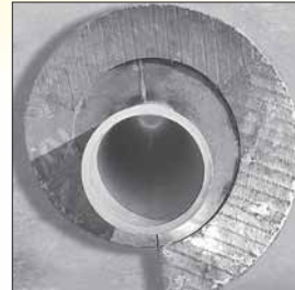
Screw conveyors protected with KALMETALL-W 100, up to 2,000 mm diameter, up to 10,000 mm length